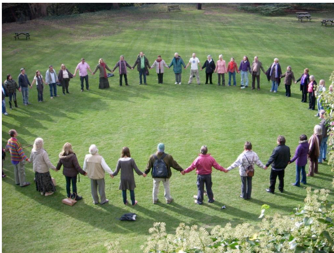
From the Fountain International Conferences in the U.K

The healing was sent at a specific time by each participating member of the group to the Old Steine and then out into the community so that when the energy went out it would be more powerful. No judgments or expectations were set; only that the energies and healing be resolved to their highest potential. There was no vision as to how this was to come about. So it is an attitude of "Thy Will, not My Will." It was only later that it was determined that on that particular weekend the police had decided to use a different strategy of non-confrontation of the "mods" and "rockers." Was that change in strategy caused by the sending out of pure love energy into the community, before the event? No one can say.