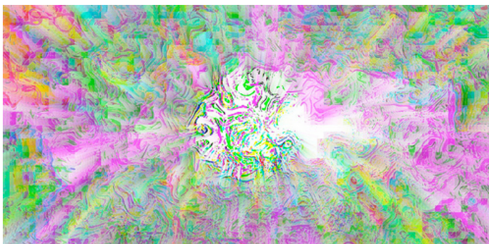
Migraine Aura. By Joana Roja

From the point of view of the ecstaticists, migraine sufferers are generally more open to altered states of consciousness because they experience frequent energy increases – even if these are uninvited and uncontrolled. This means that if migraine patients are willing to work ecstatically, they have a chance not only to control this increased energy, and thus to get rid of the unwanted migraine symptoms, but also to develop their own consciousness as well.