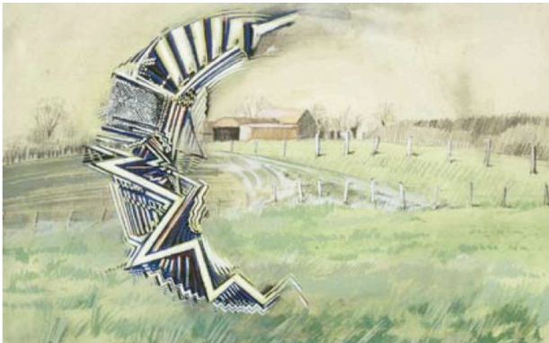
Example of a typical migraine aura in the visual field. Drawing of a patient. (Dodick, 2009)

In these alternative approaches, the focus practically never lies on the migraine aura that precedes the migraine in a minority of persons affected (10-20 %). In ancient medicine the Greek term aúra described the pre-symptom of an epileptic seizure. In the case of migraine, it serves to describe subjective "imaginary" sensory perceptions, which precede the headaches for one hour at most. Although auras can affect all senses, they usually refer to the visual sense (Göbel, 16.11.09; Dahlem and Podoll, 16.11.09).