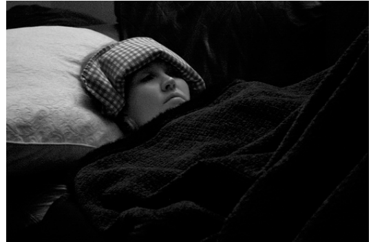
Migraine isn't fun

Migraine headaches may be unilateral or bilateral, pulsating headaches frequently accompanied by an increased sensitivity to light and noise; by nausea and dizziness; sometimes even by abdominal cramps, numbness in various parts of the body and temporary paralysis. The duration of this condition ranges from several hours up to several days. There are different neurophysiological theories about the causes of migraine, focusing primarily on changes in the blood circulation of the brain or on neural excitation. Genetic factors may also contribute to the occurrence of migraines.